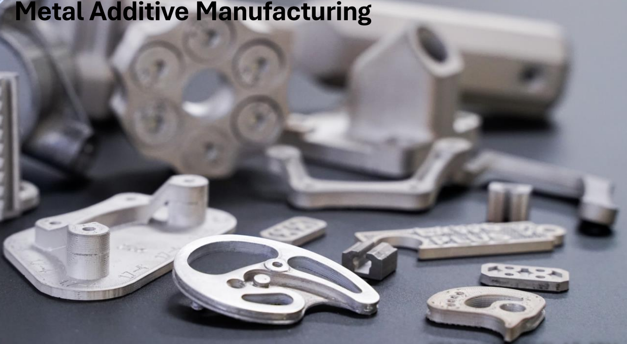
STAINLESS STEEL 17-4PH