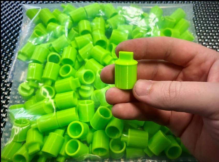
TPU (Thermoplastic Polyurethane) Rubber Fiberoptic Caps