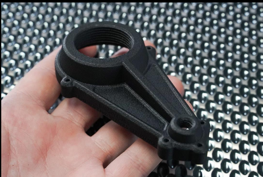
Micro Surface Textured Black ASA Crank Housing

We offer a variety of thermoplastics, including durable, heat resistant, rubberised, colourful and high performance for automotive and aerospace applications.